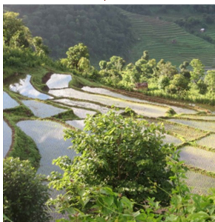
Terrace cultivation in Matupi

Local NGOs and CBOs/CSOs will also be involved (nutrition, water and sanitation, peace building...).