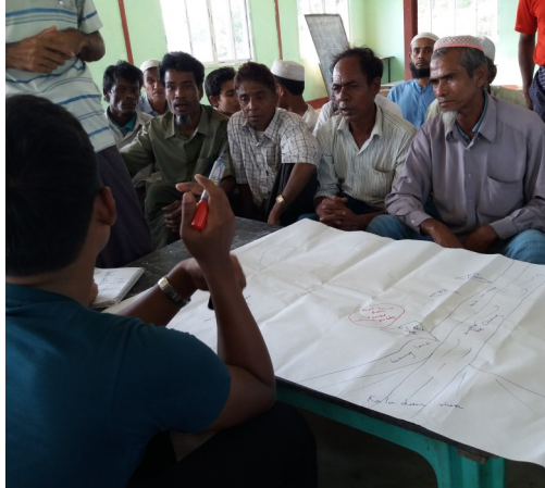
Natural Resources mapping in Pi Si Paik The village, Kyauktaw @GRET