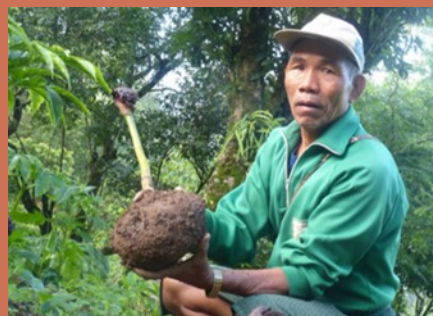
Elephant Foot Yam