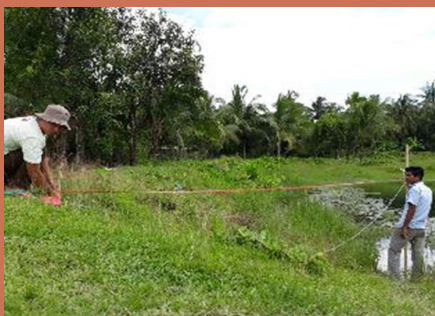
Pond slope measurement in Kyauktaw