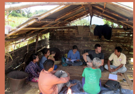
Agrarian diagnosis in Matupi