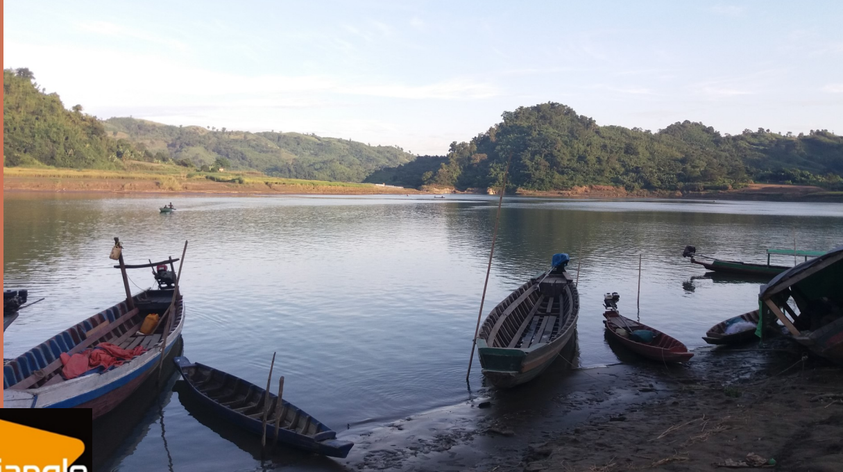
Kaladan River, Paletwa Township