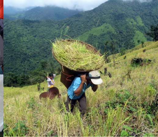
Transportation of rice harvest from slash-and-burn plot in Matupi